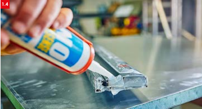
› 1.4 If using a subcill ensure the ends are filled with sealant to provide a dam before fitting the end caps.