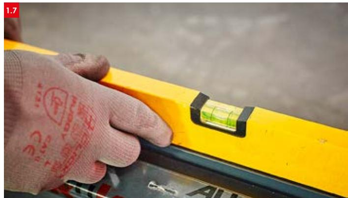
› 1.7 Recheck to ensure the cill is level and proceed to fix to substrate. Remember "check twice, fix once".