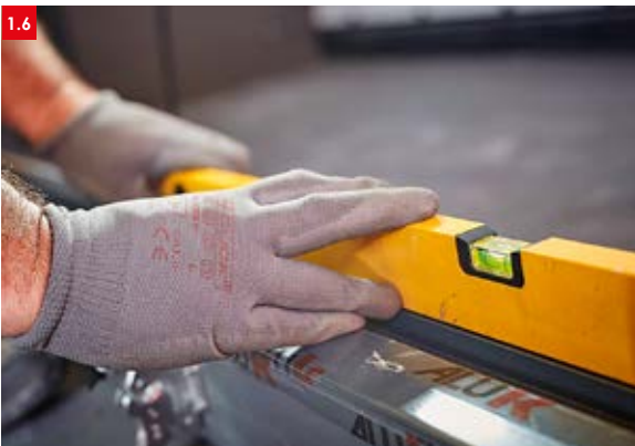
› 1.6 Place the subcill on to the substrate and level the subcill, if necessary using packers. Laser levels are ideal to assist with this process, particularly on wide installations.