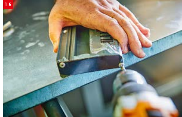
› 1.5 Fit the end cap. Note! This is not just an aesthetic piece. It must span the full depth of the subcill as it acts as a physical barrier to stop water ingress.